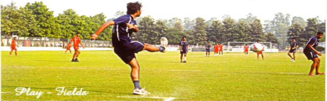
Play - Fields

The vast fields of the campus have facilities for almost all out-door games and sports, which students can avail of. The campus has an international size football-field with stadia like structure, there are proper fields for playing basket-ball, volleyball, cricket etc. The campus has a swimming-pool, boating club and gymnasium.